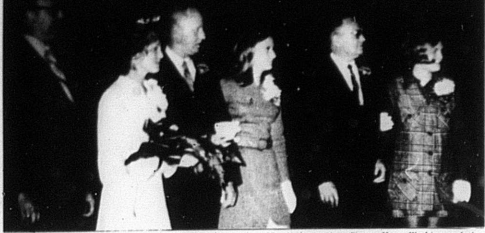
Homecoming Queen and Court