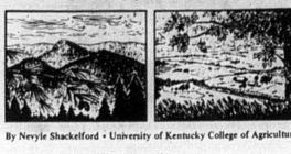
By Nevyl Shackelford - University of Kentucky College of Agriculture

In the good old days before the automobile destroyed the remoteness of the countryside, there were encounters with yellow jackets that angrily contested the plucking of grapes in the fence rows. Sometimes there were encounters with huge black snakes taking last sunbath on rockpiles before hibernating for the winter. There were the trails of strange tracks and trails in the dust of the lanes-trails and tracks of animals, insects, and birds also out foraging in preparation for the cold days to come. When the automobile came brought to an end the happy diversion of autumnal hunt and the freedom to roam over the countryside. Unfortunately, these vehicles gave mobility to hordes of marauders who had never before been able to penetrate the hinterlands. After the fashion of Attila the Hun, they tore down fences, robbed orchards, shot songbirds and livestock, destroyed crops, and littered fields and roadsides with pop bottles, beer cans, and other forms of offensive debris. With his privacy thus grossly invaded and his generosity outraged, the farmer and landowner had no other recourse than to take drastic action. As a consequence, "No Trespassing" signs now sprout everywhere—more than often backed up by loaded shotgun, and the old private property and are no longer free for the taking. Everyone are the days.