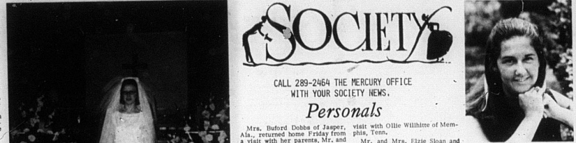
THE CARLISLE (KY.) MERCURY, THURS., JUNE 10, 1971-7