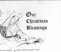
Peace on earth, good will toward men

I am going to be good at the baby-sitters from now and not cry. We will leave some cookies and milk under the tree for you.