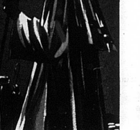
May the spiritual glow of this glorious season remain with you and bless you through the coming year.