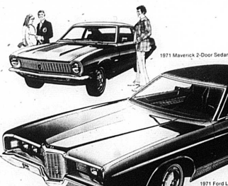
1971 Maverick 2-Door Sedan

You waited 'til now to get the deal of the year. Don't blow it on the wrong car.