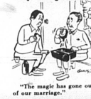
"The magic has gone out of our marriage."