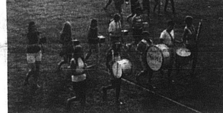
Education Group Holds Meeting