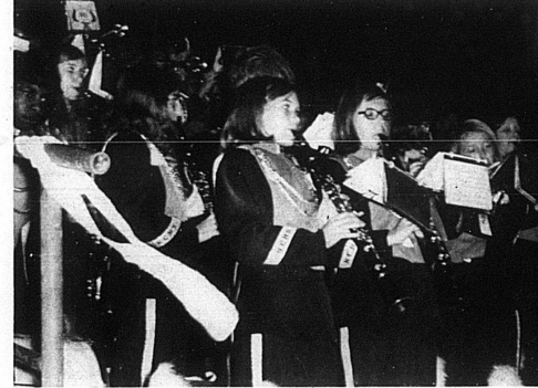
Licorice sticks are prevalent in the picture of the Bluejacket Band.