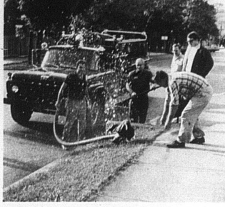
WHY THE SACK? There are times when one doesn't care for a shower bath. This picture was snapped just seconds after the burlap sack was tossed onto the water hydrant, as members of the Nicholas County Fire Department complete the job of filling their fire truck.