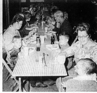
THE MEAL was sponsored by donations from the 12 volunteer firemen and one paid member who donate $1 a month into a fund to hold these affairs two or three times a year.