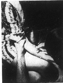
HARD DRUGS—First experiences sometimes can lead to further abuse of hard drugs.

(Photo layout by Ray Krause & Jim Warren)