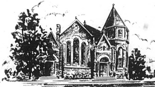
Carlisle Presbyterian Church