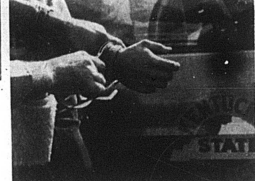
APREST-DRUG ABUSE IS AGAINST LA W

Could they be your children? How much do you know about drug abuse among our youth? To protect your children, you need to know more about the problem. Find out by attending Governor Nunn's Special Session for Citizens Concerned About Drug Abuse at Convention Center in downtown Louisville, Thursday, December third.