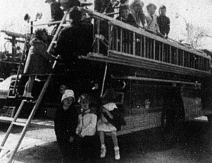
Firemen Of Tomorrow