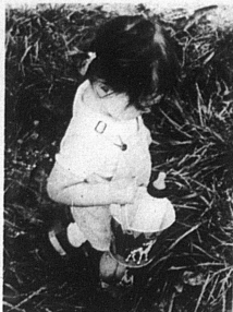
THE UNPOLLUTED-CHILDHOOD, MILK AND GREEN GRASS

(Photo Story by Karen Tam & Lois Campbell)