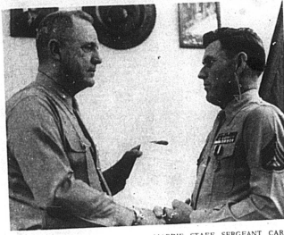
Gets Navy Medal