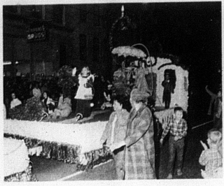
BLUE GRASS INDUSTRIES' "Wizard of Oz" float which appeared in the Joyce Chamber of Commerce Annual Christmas Parade.