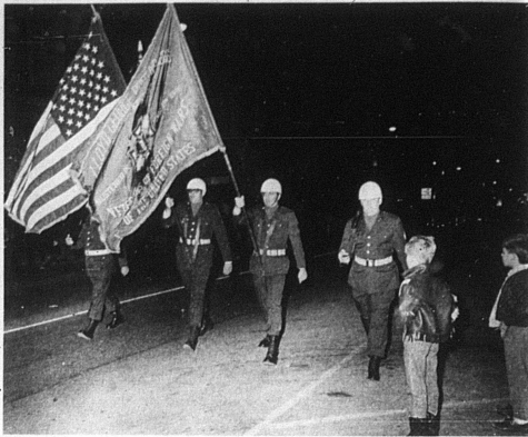
The Color Guard in The Christmas Parade