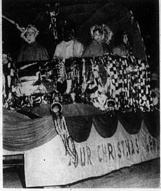
THE SECOND-PLACE winner in last year's Jaycee-Chamber of Commerce Christmas Parade was by the Carlisle Elementary P.T.A. float entitled, "Our Christmas Gems."