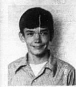
By Robby Kingsolver

With only 31 seconds to play, the Eagles were at the free throw line with a 55-53 lead. The throw was good, and Nicholas grabbed the rebound. Racing down court, Steve Kimberling made a 20 foot jump shot which tied the score. The Jackets continued to race the clock in the remaining 13 seconds. The ball was stolen from the Eagles and Reese Smoot fired the winning