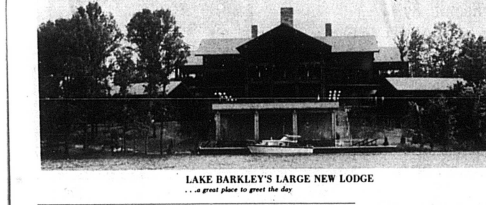
LAKE BARKLEY'S LARGE NEW LODGE... a great place to greet the day