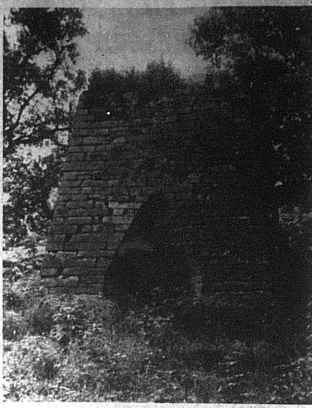
BOURBON IRON WORKS—The remains of the old iron foundry evoke a picture of past days in Bath County when six thousand slaves provided most of the iron for Kentucky and the settlements west of the Alleghenies in the early part of the Nineteenth Century.