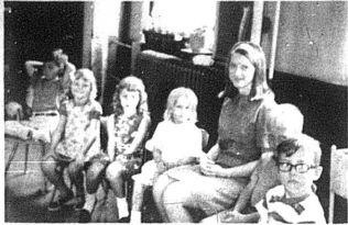
GETTING READY FOR STORY TIME