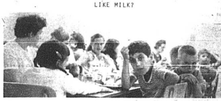
THAT WAS A GOOD LUNCH