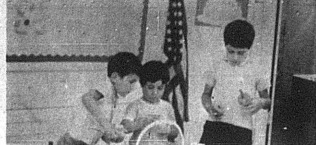
ENJOYING THEIR HEADSTART IN AMERICA