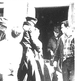
Members of the Nicholas County High School Band are shown here. The band is preparing for a performance.