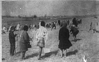
THEY'RE OFF, AND HUNTING!