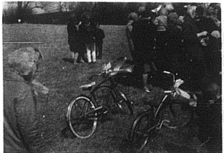
HERE'S TWO PRIZES FOR SOME LUCKY WINNERS.