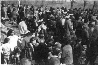
LOOK AT THE CROWD AND THE HEAVY COATS TOO.