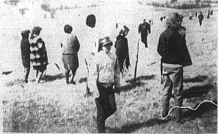
IS THAT A WINNING EGG IN HIS RIGHT HAND.