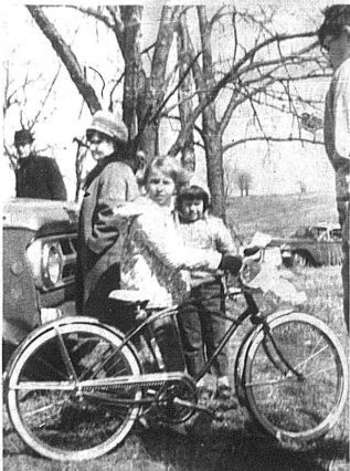
SHE'S A LUCKY WINNER.