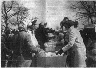
PLENTY OF EASTER BUNNIES HERE.