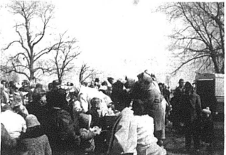
MORE CROWD AND WINTER WRAPPINGS.