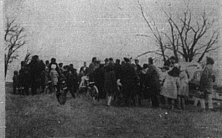
JUST MORE PEOPLE AND BICYCLES.

With adults shivering and shakng Sunday afternoon, at 2 o'clock -- the kids had great fun -- they didn't seem to mind the cold as they waited for the starting whistle to hunt for those plastic Easter eggs and prizes.