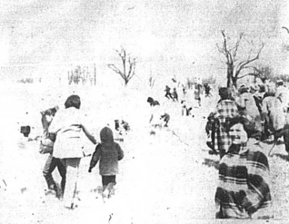
HUNTERS TO THE RIGHT AND HUNTERS TO THE LEFT.