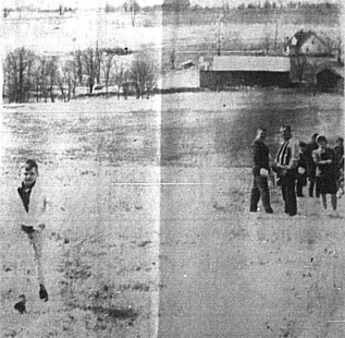
BET HE'S GOT A PLASTIC EGG.