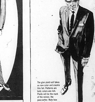
Let a winner lead the way... in vibrant green plaids by Varsity-Town

"Big"—classic split shoulder ballroom, man tailored but very conscious of the feminine gender for the girls only... Size Reg. 10-18 Wyrick's Fashions And Marie Norman Cosmetic Studio Phone 289-2512 "Home of Better Clothes and Samsoneo Luggage"