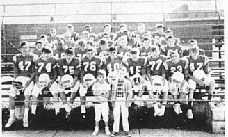
LITTLE LEAGUE FOOTBALL TEAM