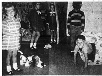
5. BEST TIME -- Play Time