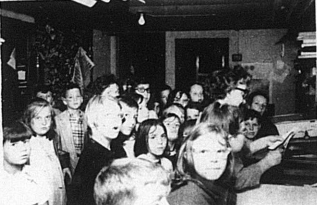
WATCHING—Yep, they're watching the camera instead of the paste up operation, but you can't blame them. Shown are members of the St. Nicholas County Elementary School fifth or sixth grade.

Carlisle Drug Co. THE "REXALL" STORE CARLISLE, KY.