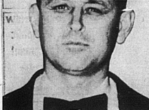
JAMES EARL RAY, also known as Eric Starvo Galt, Harvey Lowmyer, John Willard, James McBride, James Walton, W. C. Herron and James O'Gorman.

Wish I'd Said That - A person from the... "I don't take the relatives as long as I remember from a rich uncle as from the fact that he didn't have any thing..."