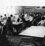
LUNCHTIME in the sparkling Reception Center dining room is a