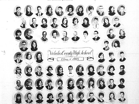
Nicholas County High School Class of 1968