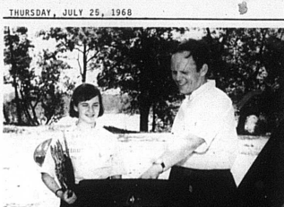
The year-old students of the Kentucky Post and Times-Star, Covington, who will address the young journalists July 27.