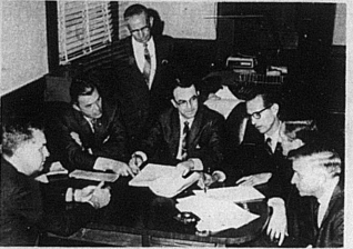
LEGISLATIVE CAUCUS—Republican leaders of the Kentucky Legislature meet in caucus to map legislative plans for the 1966 General Assembly.

YOUR LIBRARY Incident at MVC WA, by Daniel Ford, A novel of war in Southeast Asia; The Chilly Sibernian Morning, by Douglas Boling, An adventure-photographer's daring journey through the Siberia to new free Westerner had seen