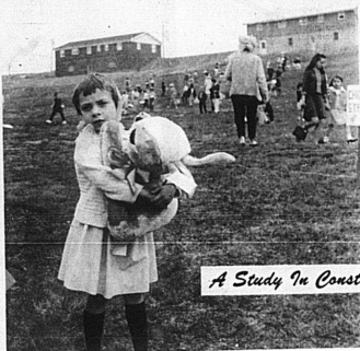
A Study In Contrasts ...