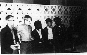
Part of the Jaycee Little League football team shown at the banquet held Sunday, Nov. 5 at the Blue Grass dining room. Each player was awarded a trophy for participating on the team.