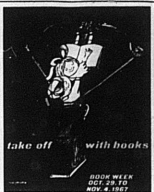
take off with books