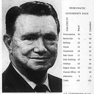
HENRY WARD, GOVERNOR-ELECT