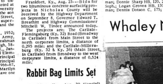
Special Meeting Called