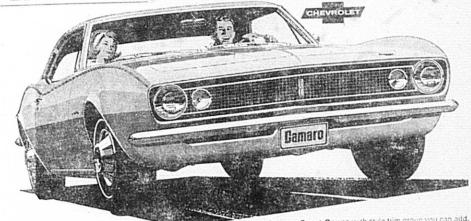
Camaro Sport Coupe with style gives you a car you can't find.

You've been waiting for a Chevrolet like this. Now it's here.