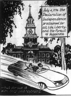
Public display of the Declaration of Independence with songs and restraint.