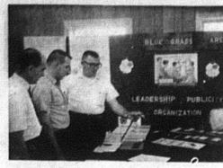
The first annual meeting of the Kentucky Extension Agents in charge of 4-H programs in each county in Kentucky was held at the North Central 4-H Camp here in Nicholas County last week.