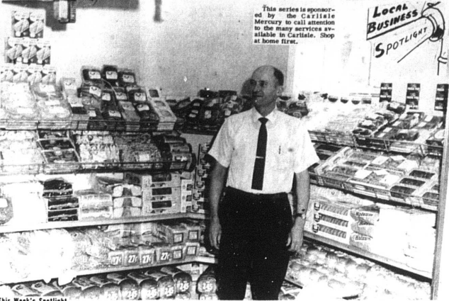
This series is sponsored by the Carlisle Mercury to call attention to the many services available in Carlisle. Shop at home first.