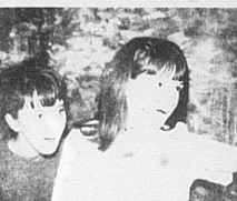
Fun For Old and Young, See Winnie-the-Pooh

Nicholas County High School Speech Department will present for the public a play for Christmas. It is a very delightful story which many people have read and found fascinating. The play involves some very unusual animals in a very funny forest. It is Winnie-the-Pooh by A.A. Milne and has proven to be extremely hilarious to old and young alike. It will be presented at the Carlisle City School Saturday night, Dec. 17, at 8:00 p.m.