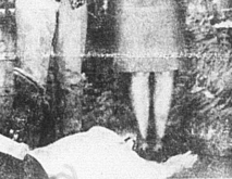
Abode and Belove—Scenes from High School Play