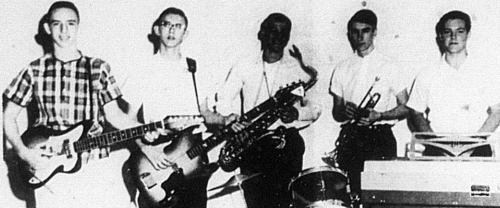
THE "VIBRATIONS" are playing for a dance Saturday evening, August 6, 8 to 11 o'clock, at the Sharpshooting fire house.