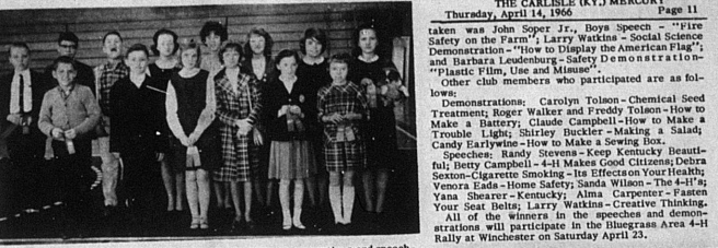
The winners in the 4-11 demonstrations and speeches at the Nicholas Co. 4-11 Rally Day held on Saturday, April 2, posed for a picture...