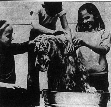
Who's the only one here that doesn't like