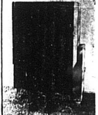
The Curtain Closed The Voter Inside Voting

DIRECTIONS for VOTING on the AUTOMATIC VOTING MACHINE 1st— Move the Red Operating Lever to the Right and leave it there. 2nd— Turn down the Voting Pointer over the name of each Candidate you wish to vote for from this position to this position X and LEAVE THE VOTING POINTERS DOWN. 3rd— Move the Red Operating Lever to the Left.