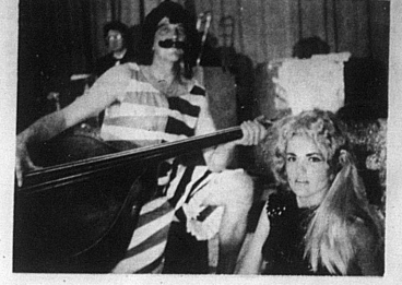
Did you see 'Minnie' and 'The Old Man of the Sea' at the recent Pantomime Show?