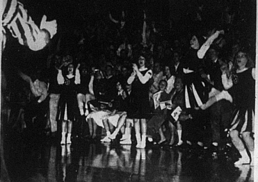
Fourteen County High whoops it up as their team wins the 40th District tournament.

Physicians involved will serve as General Duty Medical Officers. The requirements of the services which are to be met by this call are as follows: Army 500, Navy 175, Air Force 125. The need for specialists in the Armed Forces Medical Services is filled by volunteers who have been deferred for specialty training under the Berry Plan and by physicians who are completing their military residencies. The last Selective Service call for physicians was effective in the summer of 1964. In the past, physician calls in some cases have been modified upward or downward after issuance.