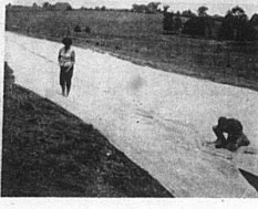
Glenn Clay (left) starts Star Gauce on a waterway project he expects to show farmers during an agricultural field day tour being planned by various agencies for August 5, on the Clay farm.