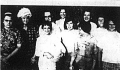
DAY CAMP: Top, Unit II, Jack-in-the-Pulpit; Unit III, Junebug; Cadette Troop 168, Blue Bird Patrol; Red Bird and Robin Patrol.

THE MERCURY DISPLAY ADVERTISING DEADLINE IS 12 NOON ON TUESDAY. THE CLASSIFIED PAGE CLOSURE AT 5 P.M. TUESDAY.