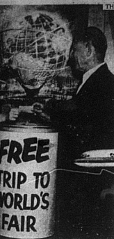
FREE TRIP TO WORLD'S FAIR

Plans and Specifications of bids do not in any case deliver your plans and Specifications to any bidder. Plans or Specifications to be returned to the Architect, otherwise no return will be made. All checks shall be made payable to "The Nicholas County Public Library Board." Bids must be accompanied by a certified check, payable to such local agent who shall not divide such commission with any person other than a duly licensed local agent. Bids upon their receipt by the Nicholas County Public Library Board are stamped, showing the hour and date received. Bids received after the scheduled closing time for the receipt of bids will not be considered, provided legal and accepted bids have been received on said tendered invitation. In the event an award is made and the successful bidder fails to furnish a satisfactory Performance Bond and fails to execute a contract for the construction of the work under the contract, then the bid bond or Certified Check shall be forfeited to the Owner as liquidated damages for such failure. The Proposals, including the Bid Bond or Certified Check, shall be in a sealed envelope bearing the bidder's identification, addressed to The Nicholas County Public Library Board, Carlisle, Kentucky and labeled in the lower left-hand corner: Proposal Library