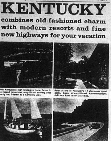
From Kentucky's lush hilly farms to the rugged mountains, magnificent scenery adds beauty and interest to a Kentucky visit.

Whenever you go in Kentucky you can travel on modern highways like the Mountain Parkway in the stored Cumberland of Eastern Kentucky.