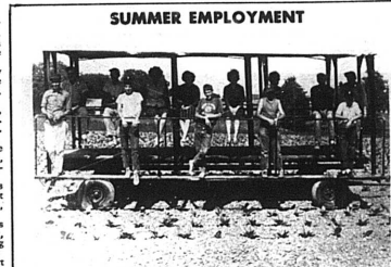
"Employees Will Ride in 65" Here is an excellent opportunity for high school girls and housewives, who would like to have a part-time job this summer to earn additional income for school or of that new appliance which you would like to purchase.